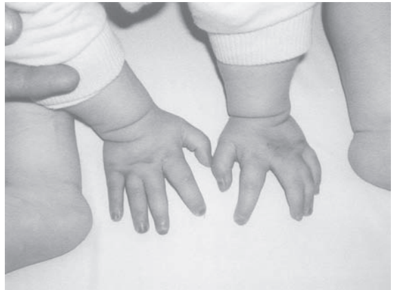
Fig. 2a. View of the hands.

normal. Her laboratory analysis revealed hypernatremia and indirect hyperbilirubinemia. Her sodium and glucose levels were increased, at 178 mEq/L and 214 mg/dl, respectively. Intravenous hydration and phototherapy were started. After treatment, she was discharged from the hospital.