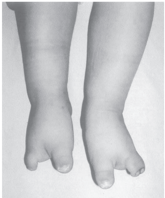
Fig. 2b. View of the feet.

Despite her elevated sodium level, her appearance and performance had no correlation with a thirsty baby. After improvement of sepsis, she had unexplained elevated body temperature of 39°C. Her urine output was as high as 5.5 ml/kg/h. Diabetes insipidus was clinically suspected but water deprivation test was not performed because of the risk of severe dehydration. Her laboratory investigations were obtained at the beginning of the desmopressin test. The data were as follows: Na 174 mEq/L, blood urea nitrogen (BUN) 14 mg/dl, creatinine