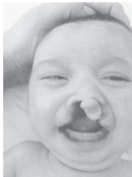
Fig. 1a. Her appearance at 2 months old (before surgery).

ears, ocular hypertelorism, abnormal palpebral slant, microcephaly (Fig. 1A), ectrodactyly (lobster claw deformity with tetrasyndactyly) (Fig. 2A, B), and cephalhematoma. The remainder of the physical examination was