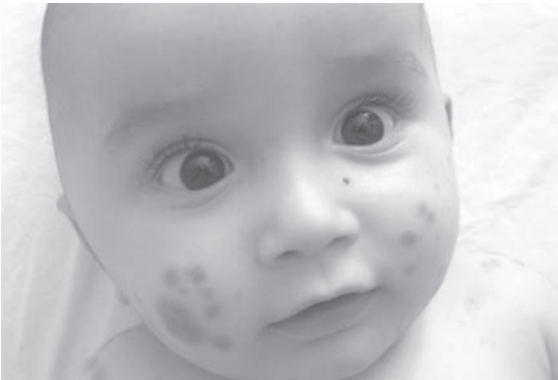
Fig. 1: Confluent rosette-shaped purpuric plaques of the cheeks.