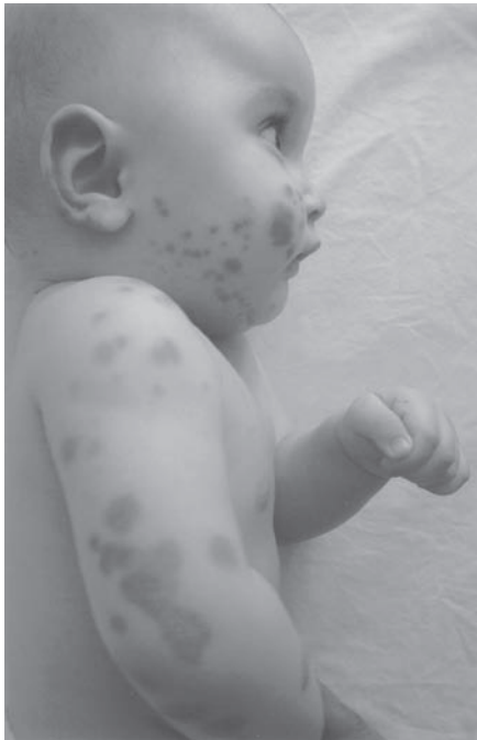
Fig. 2. Purpuric skin lesions on the right arm and face.