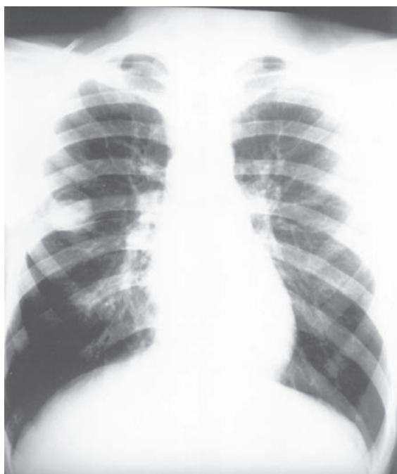
Fig. 1. A chest X-ray taken eight days after the accident shows a 3.5 cm-diameter partially opaque lesion in the right lung. Two other lesions were identified in the right lung: one cranial and the other caudolateral to the hilus, and both featuring infiltration in the surrounding parenchyma.

We planned to rule out pulmonary tuberculosis by examining a sputum smear for acid-fast bacilli, but the patient was unable to provide a sputum sample. Fluid specimens from two gastric lavage and two bronchoalveolar lavage