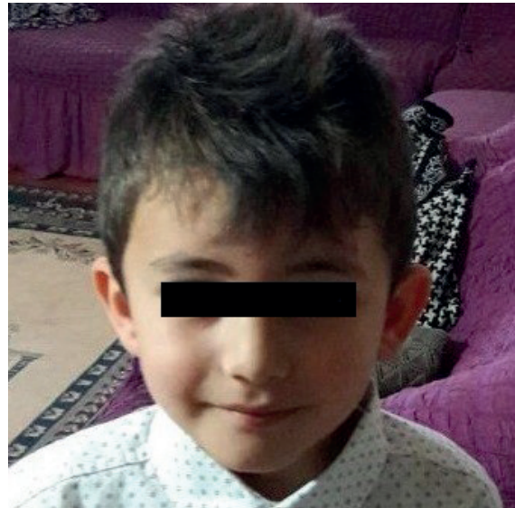
Fig. 1. Spider bite lesion above the left eyebrow.

A previously healthy five years old boy living in the Zonguldak area of the Northern region of Turkey had a red spot, like an insect bite, just above the left eyebrow, which was noticed by his parents (Fig. 1). Three days after the red spot was seen, the erythema expanded, and edema occurred on the left eyebrow and eyelid. He was hospitalized at a local hospital's dermatology service on the second week (Fig. 2). Ampicillin-sulbactam, amikacin, vancomycin, ceftriaxone, metronidazole, methylprednisolone, and pheniramine treatments were initiated. He received the treatment for five days; however, erythema and edema continued to expand. Originating from the first red spots localization, skin necrosis developed above-left eyebrow. He was referred to the city's university hospital after five days. Systemic penicillin, metronidazole, clindamycin, gentamicin, streptomycin, ciprofloxacin, fluconazole, methylprednisolone, pheniramine, ibuprofen, and local therapy, including moxifloxacin eye