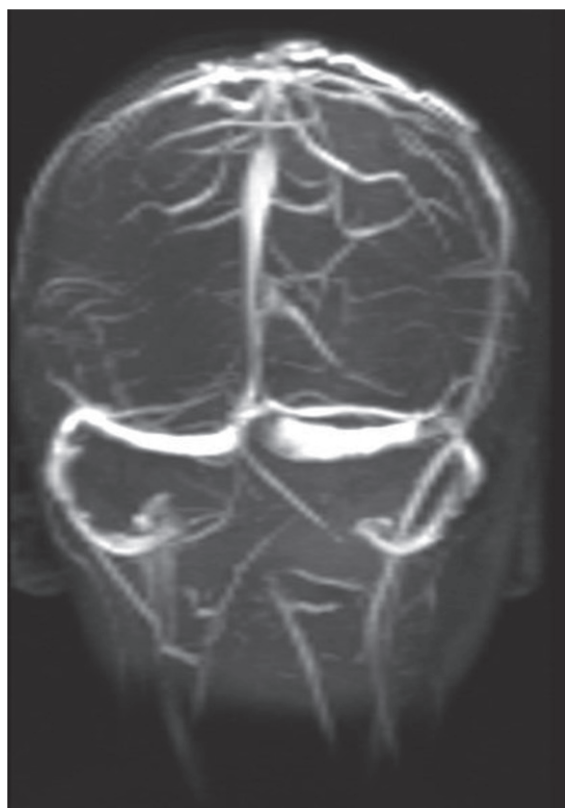
Fig. 3. The flattening on the left transverse sinus (pseudotumor cerebri).