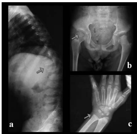
Fig. 2. Dysostosis multiplex (a. Vertebral beaking, b. Shallow acetabulum and c. Mild hypoplasia of medial distal radius, and mild cortical tinning of metacarpal bones) on X-ray.

distinction, historically two clinical subtypes of fucosidosis have been delineated. Type I is the rapidly progressive form, beginning before one year of age, leading to rapid neurological deterioration, seizures, growth retardation and visceromegaly. Death occurs in the first decade. Type II is the slowly progressive form, with onset usually before age two and a slower advance of neurologic deterioration, spasticity and angiokeratomas. Most individuals survive to ages 20-40. Type I and type II fucosidosis represent the extreme poles of a continuous clinical spectrum. Williams et al. 3 reviewed findings of 77 fucosidosis patients; 17 of 77 cases were symptomatic before age one, and 14 of these individuals died before age 10. No associations exist between disease severity and