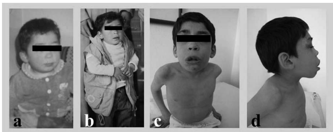
Fig. 1. The progression of coarsened facial features and disease from 4 to 12 years of age.

Over time, multisystemic progressive substance accumulation leads to progress in symptoms and signs. The main clinical features are progressive neurologic deterioration (95%), coarse facial features (79%), growth retardation (78%), seizures (38%), recurrent sinopulmonary infections (78%), visceromegaly (44%), angiokeratoma corporis diffusum (52%) and dysostosis multiplex (58%). 3 There is considerable heterogeneity in clinical presentation, even in members of the same family. A comparison of the clinical findings of the previous study and our case is given in Table I. Although there is no precise clinical