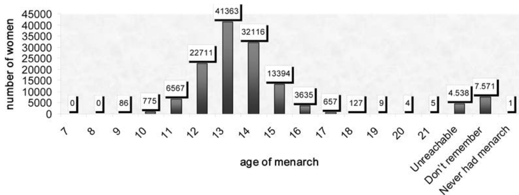
Fig. 2. Trend for age at menarche among women aged 15-49 years in the area of the Health Directory of Bornova, Izmir in 2003.