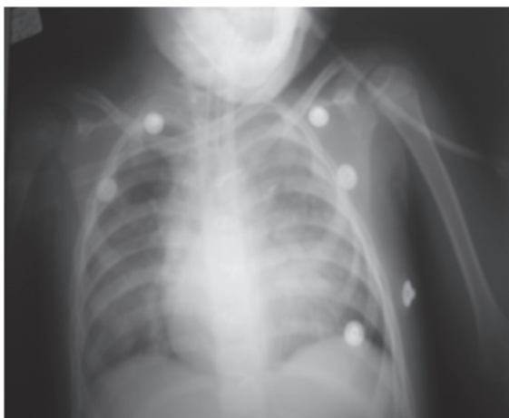
Fig. 1. Chest X-ray taken after the patient's massive pulmonary hemorrhage.

bilirubin (4 mg/dl), aspartate aminotransferase (1300 U/L) and alanine aminotransferase (1100 U/L) due to congestion. A graft thrombosis was suspected and heparin infusion was started. One day later, massive pulmonary bleeding occurred. There were bilateral consolidations in the lungs due to pulmonary hemorrhage and edema (Fig. 1). Her heparin was stopped immediately and protamine sulphate was administered. Platelet suspension and fresh frozen plasma support was given. Elevated liver enzymes returned to normal values after nine days. Although spontaneous bleeding stopped, post-aspiration bleedings continued. The detailed examinations of bleeding diathesis revealed prolonged in-vitro bleeding time using the collagen-adenosine diphosphate - platelet function assay-100 (Col-ADP - PFA-100) as 160 seconds (Normal range: 68–121) and low factor VII level (10.8%, Normal range: 50–129%). The patient was monitored in MV throughout the follow-up, which lasted 20 days. We observed life-threatening bleedings during endotracheal aspirations. The patient could not be extubated. Bronchoscopy was performed, which demonstrated widespread hyperemia, loss of mucosa, numerous bleeding sources, and mucosal bleedings throughout the airways. Due to the patient's bleeding diathesis, iatrogenic