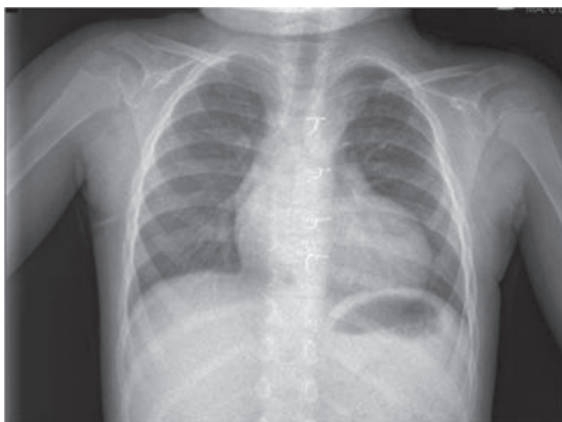
Fig. 3. Chest X-ray after extubation and eight days of noninvasive ventilation.

bleeding or necrotizing tracheobronchiolitis was suspected. Argon was applied to control the severe bleeding (Fig. 2).