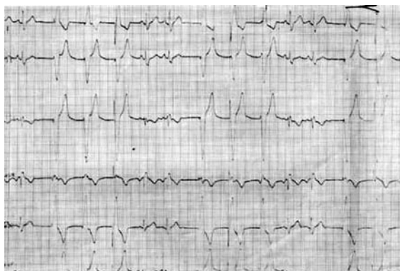
Figure 2. Complete AV block and temporary pace pulses.

Ventricular septal defect (VSD) is the most common congenital heart disease, and 70% of defects are perimembranous 1 . Transcatheter closure of VSDs has emerged recently as a good alternative to surgical repair, with high success rates and low morbidity. Convenient devices were developed in recent years in order to close firstly muscular and then perimembranous defects. However, perimembranous VSD constitutes a special case since the technique for transcatheter closure is more complex