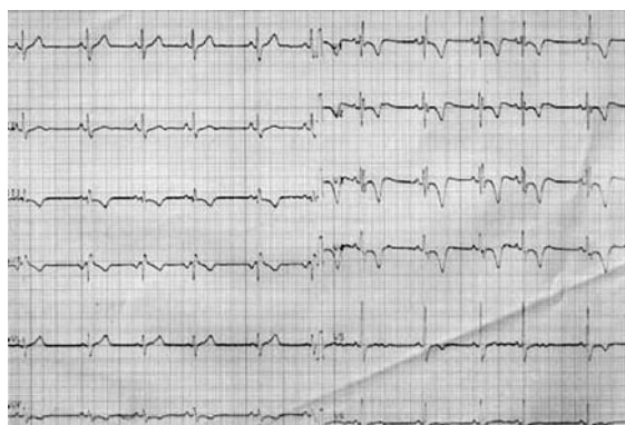
Figure 3. Sinus rhythm and right bundle branch block configuration after the anti-inflammatory treatment.