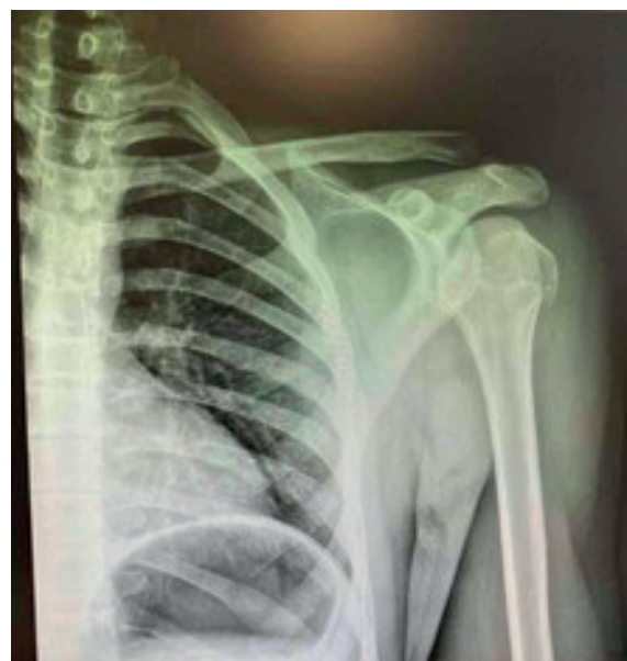
Fig. 1. Plain radiography of the left shoulder.

On admission to the hospital, initial radiography imaging was performed (Fig. 1). The proximal humerus was in an internal rotation position. The fractured fragment of the proximal humerus included greater tuberosity and was dislocated anteriorly and caudally around five millimeters. Orthopedic