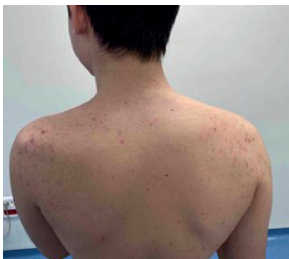
Fig. 3. Muscular hypotrophy of the left humero-scapular region.

Proximal humeral fractures in the pediatric population are not frequent, comprising around 2% of all fracture subtypes in children. 12 Shoulder dislocation as well as proximal humeral fractures increase the chance of brachial plexus injury as well as isolated peripheral nerve lesions. However, traumatic brachial plexus injuries are rare in children, and their prevalence is reported to be ten times